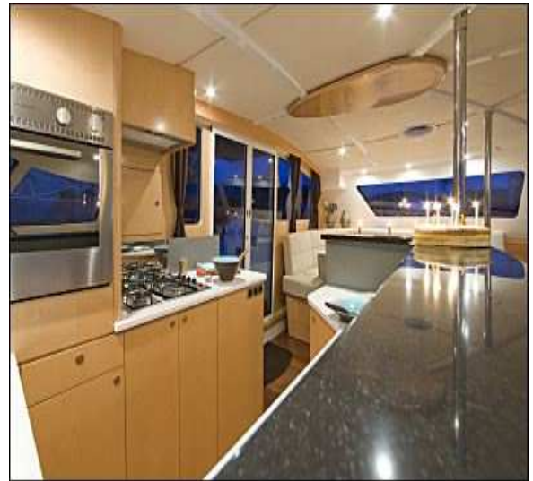
Bar & Kitchen