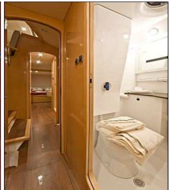
Double cabin with ensuite bathroom