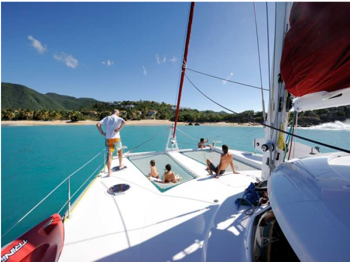
Passengers on the bow